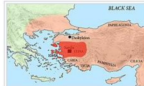
Lydia, including Ionia, during the Achaemenid Empire.