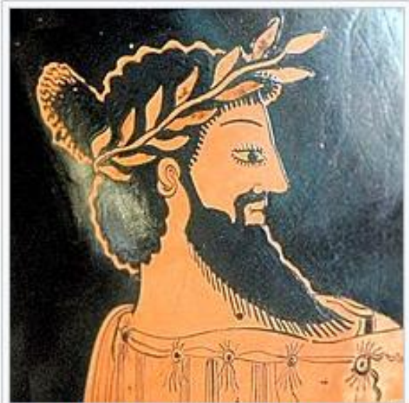
Portrait of Croesus, last King of Lydia, Attic red-figure amphora, painted ca. 500–490 BC.